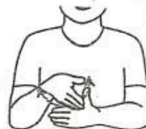
SHARE Side of right hand arcs from side-to-side, on side of palm-in left hand between thumb and index fingers