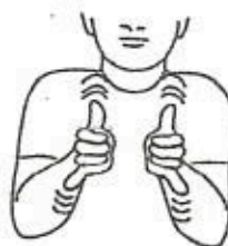
PLAY Y-hands face each other, shake