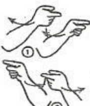
GAME G-hands, one palm-out, one palm-in, swing back & forth, pivoting at wrists