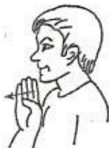
BE Palm-left B below lips; move forward