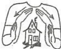
HOUSE Flat palms outline roof and sides