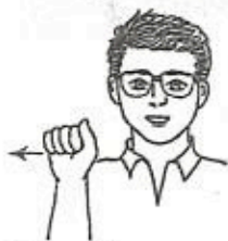
A (article) Palm-out A moves slightly right