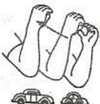
CAR Right C-hand behind left C; right moves backwards