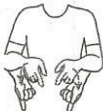
GO G-hands face each other, roll out to point forward