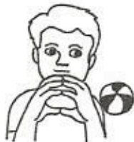
BALL Claw hands form ball shape