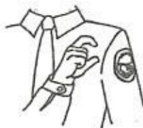
POLICE+ Small C shows badge on left shoulder