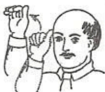
MAN A on temple, then measure height with bent hand