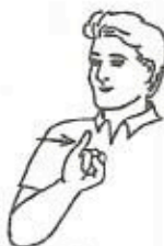
I Palm-left I-hand on chest