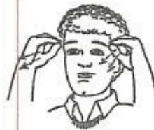
TEACH* Flat-O's pointing to temples move forward slightly; repeat