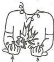
FIRE+ Palm-up bent 5's move upward fluttering fingers