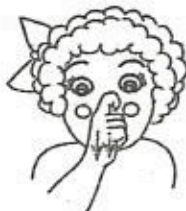
DOLL Right X-finger brushes off tip of nose