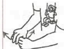
SWING Right bent-V sits on 2 fingers of left hand and swings forward and back