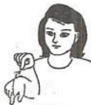
PICK Palm-down G-hand rises while fingers close (picking up)