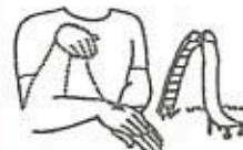
SLIDE Right palm-down hand slides down and outward over back of left hand