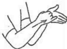
IT Tip of I touches palm of left hand