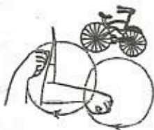
BIKE Palm-down S-hands pedal