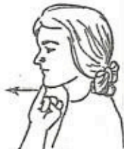
IS I on chin moves straight forward