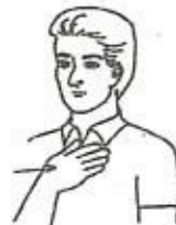
MY Palm of flat hand on chest